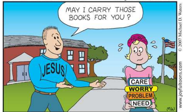
CARRY YOUR BOOKS? A Joyful 'toon by Mike Waters

Casting all your care upon him; for he careth for you. -1 PETER 5:7 KJV